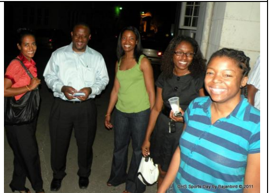
...and ended in the Lounge.