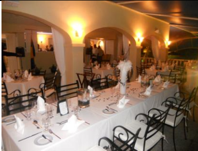
A good time was had by all at the Black & White Charity Ball!