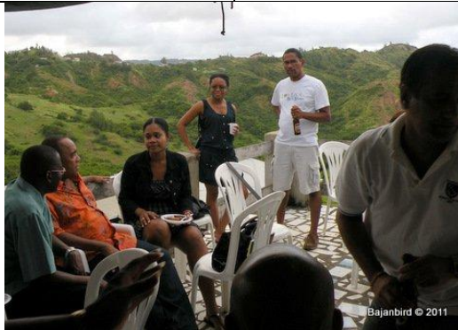
Beautiful St. Joseph and the Post-Kadooment Lime.