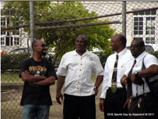
Founders Week Sports Day. The lime started on the Courts and fields...